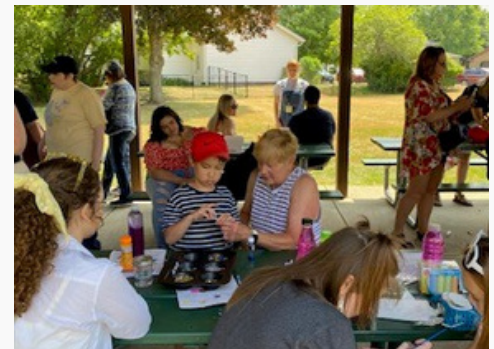
Guests participating in activities.