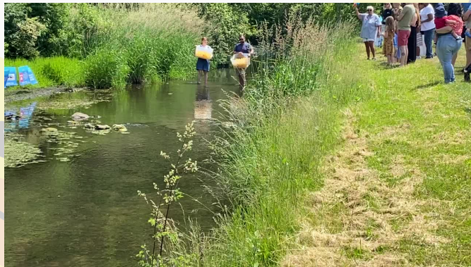
Click to watch race

Spectators came from North Canton, Akron and New Philadelphia to participate in this year's activities.